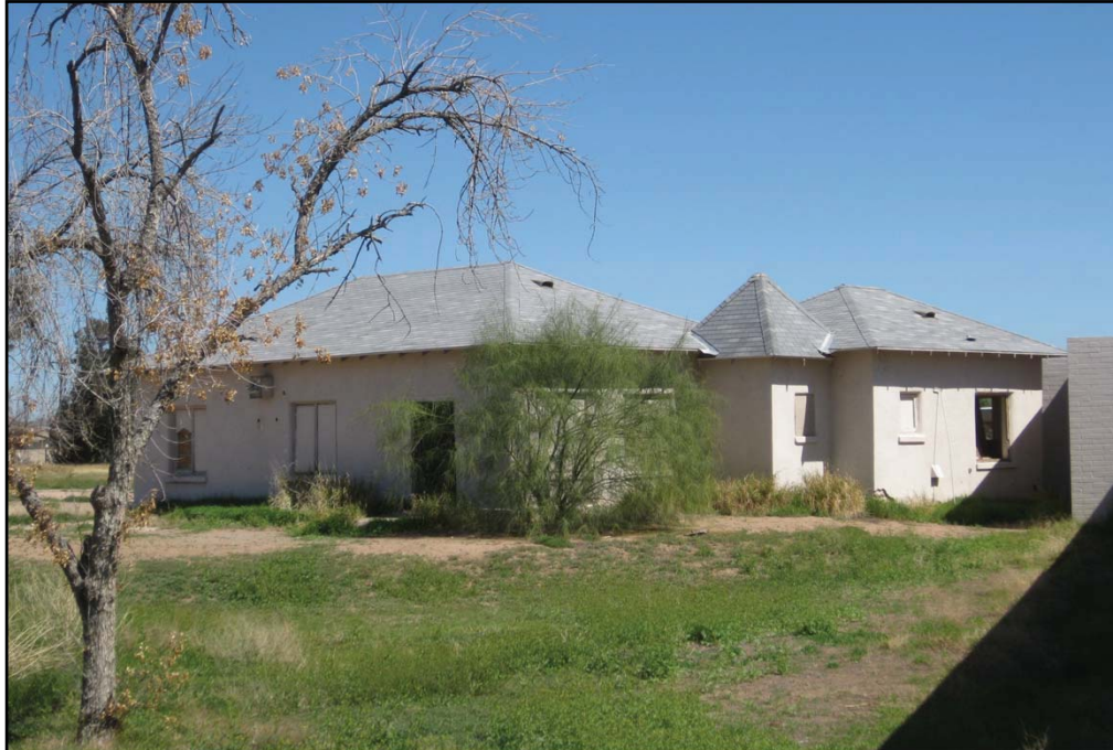
Oberbeck House (1908) 708 S Lindon Lane

Constructed in 1908, the house is significant as the 40th oldest building in Tempe, that is to say only 39 buildings are believed to predate the Oberbeck House. It is in the upper 99th percentile of all Tempe buildings in terms of age ( p\%=0.999 ). The Oberbeck House is significant for its association with Tempe's historic rural farming landscape.