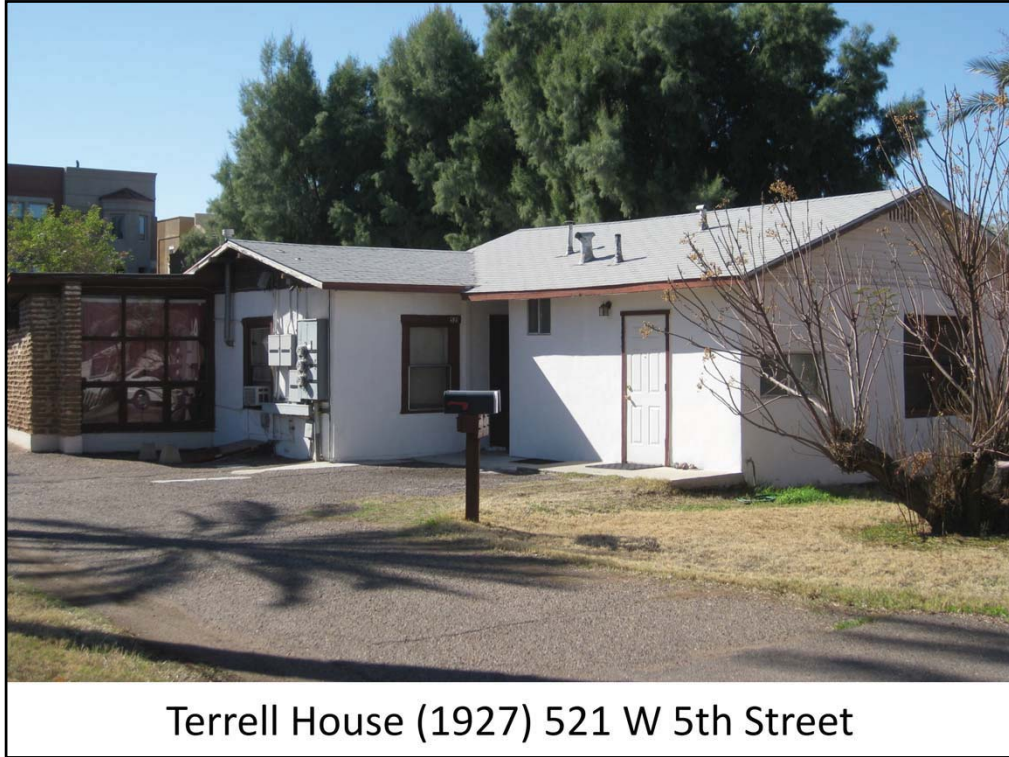
Terrell House (1927) 521 W 5th Street

Constructed in 1927, the Terrell house is significant as the 116th oldest building in Tempe, that is to say only 115 buildings are believed to predate the Terrell House. It is in the upper 99th percentile of all Tempe buildings in terms of age ( p\%=0.998 ). The Terrell House is significant for its association with Tempe's historic Section 16.