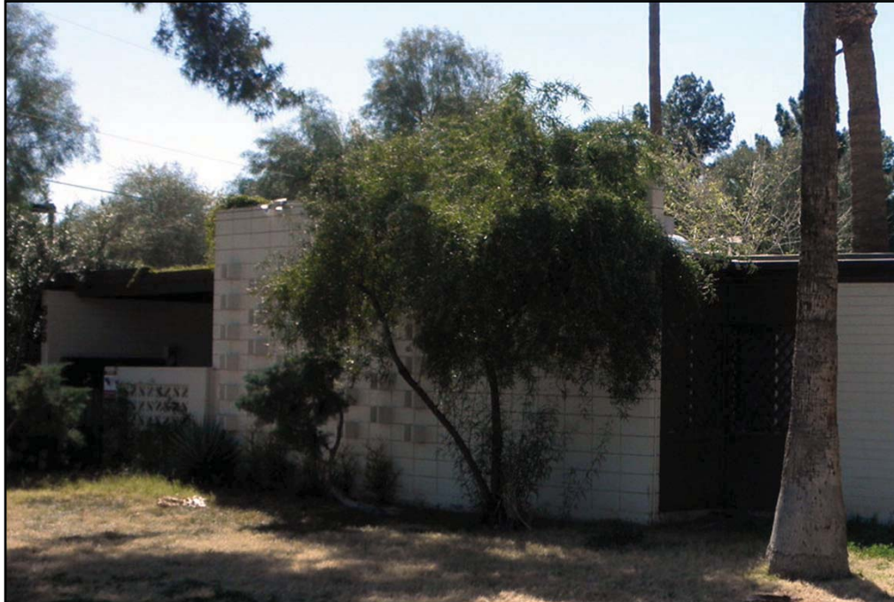
Patio Palms (1960) 626 S Wilson Street

Constructed in 1960, the Patio Palms is significant for its association with Tempe's postwar population boom, which triggered the development of a series of multifamily properties west of Mill Avenue in Section 16; Patio Palms is considered to be among the most architecturally significant.