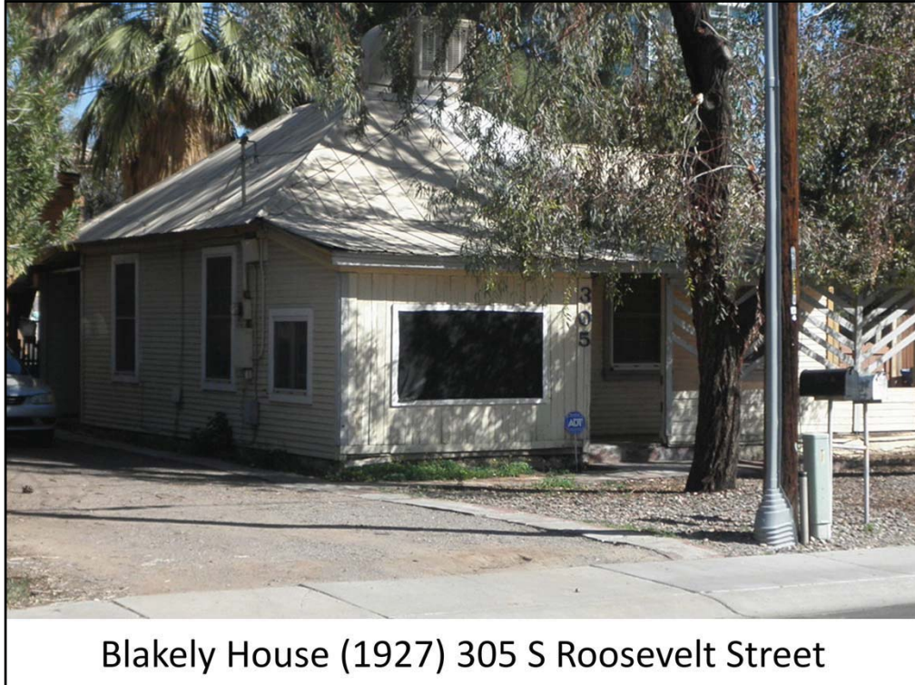
Blakely House (1927) 305 S Roosevelt Street

Constructed in 1927, the house is significant as the 118th oldest building in Tempe, that is to say only 117 buildings are believed to predate the Blakely House. It is in the upper 99th percentile of all Tempe buildings in terms of age ( p\%=0.998 ). The Blakely House is significant for its association with Tempe's historic Section 16.